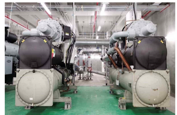
This image is for illustrative purposes only and does not represent the actual chiller unit.

Expected delivery is in July 2024, on schedule for completion by the end of August 2024.